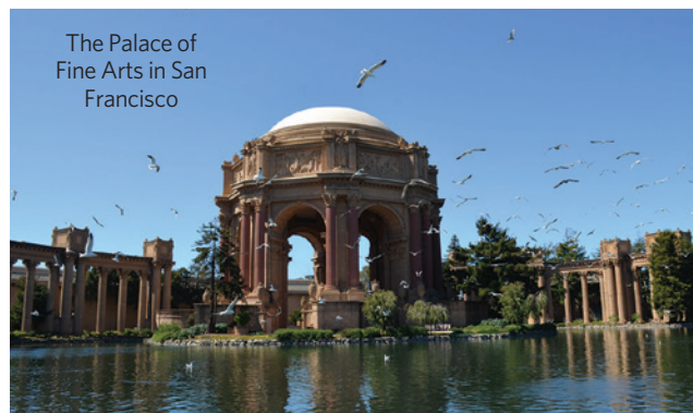
The Palace of Fine Arts in San Francisco

Forty-seven miles of walkways connected exhibit halls constructed by 31 countries and many states. The structures, which were designed to be temporary, included a full-scale replica of Yellowstone National Park's Old Faithful Inn and a working model of the Panama Canal. The only remnant of the Exposition that remains today is the Palace of Fine Arts, which was restored in the 1960s.